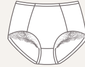
WOMEN'S FULL BRIEF